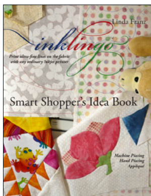
Free Idea Book